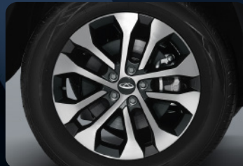
Velg 18 inch with Two-tone Finish