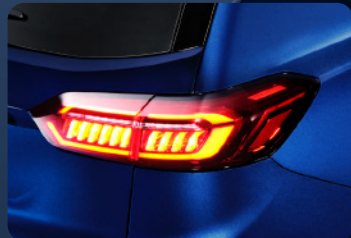
LED Rearlamp with Sequential Turn Signal