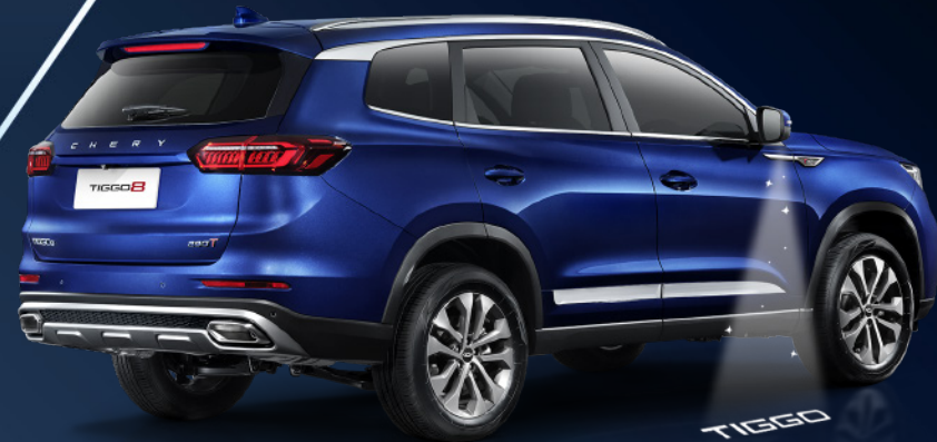
Tiggo Fashion Welcome Light