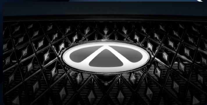
Illuminated Logo Lighted