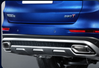
Dual Exhaust with Chrome Platted