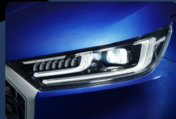
Full LED Headlamp with DRL Light System