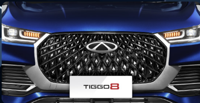
Galaxy Front Face with Matrix Diamonds Front Grille